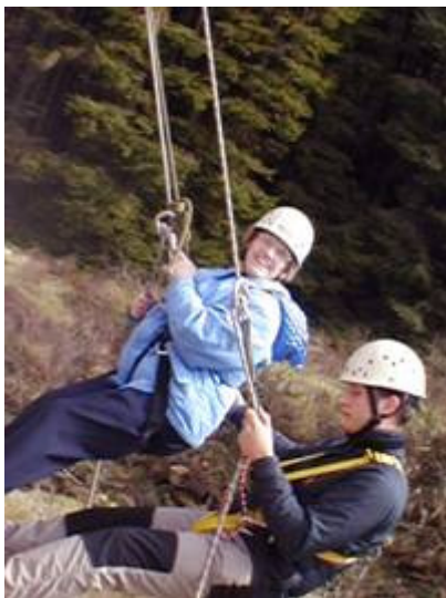
"I like the challenge" Service User